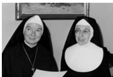
CSJ Sisters at the Motherhouse will present a musical

Let's get a good contingent of Orange County Serrans up there. It's a great time to socialize as well as to be informed and sanctified. This is close enough to home to drive up (think carpool) and maybe spend a couple of extra days enjoying the beauty of the area. Watch for more information.