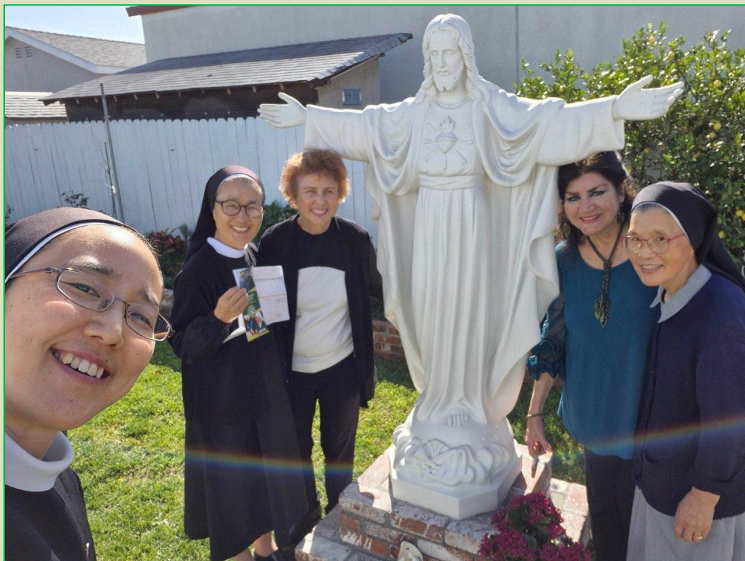
Presentation of $1,000 Monsignor Sammon Fund distribution to convent of the Korean Martyrs Sisters.