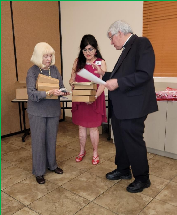
Blessing of the membership kits, badges and certificates.