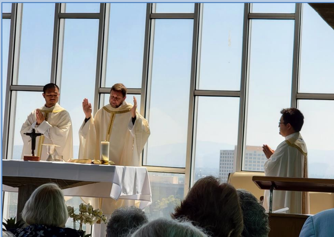
Mass in the Chapel in the Sky.