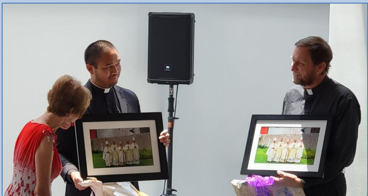
Presentation of the gift of framed Ordination pictures.