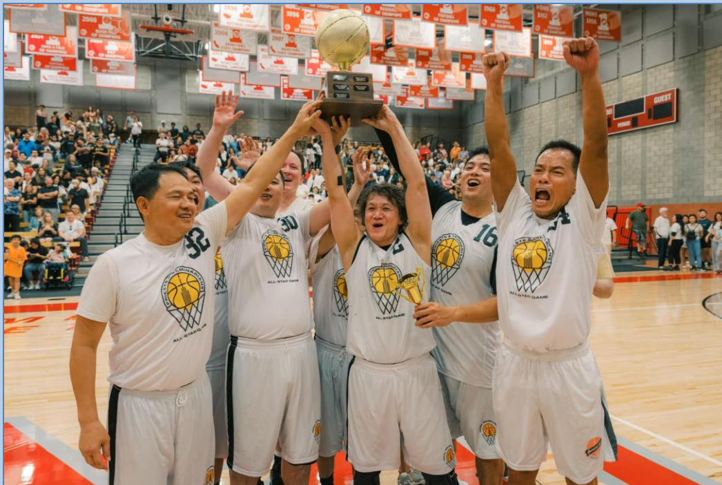
Team North County won 52-50. 3000 gathered to raise money for our Diocesan Vocations Office.