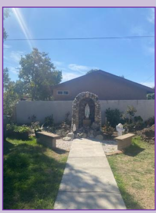
Garden at Convent