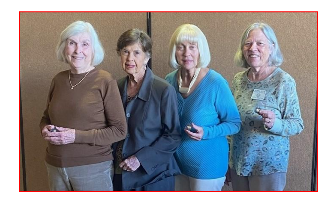
Happy Saint Valentine's Day!

celebrate them together on Wednesday in a manner that doesn't violate the rules or spirit of the occasions. Whatever you do, remember the Saint after whom this holiday (holy day ) is named.