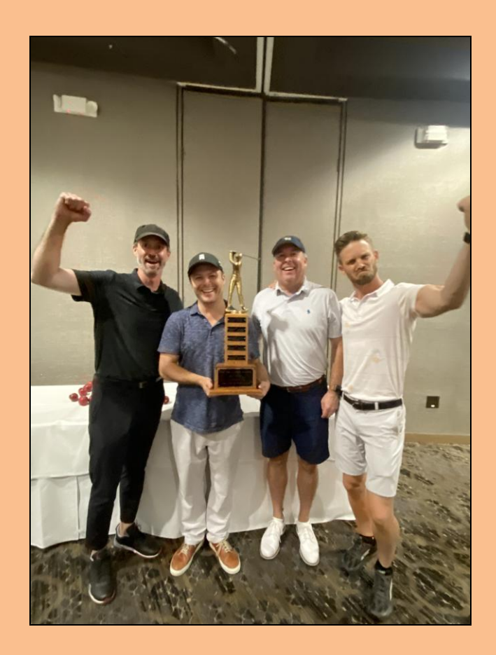
Golf Tournament Winners