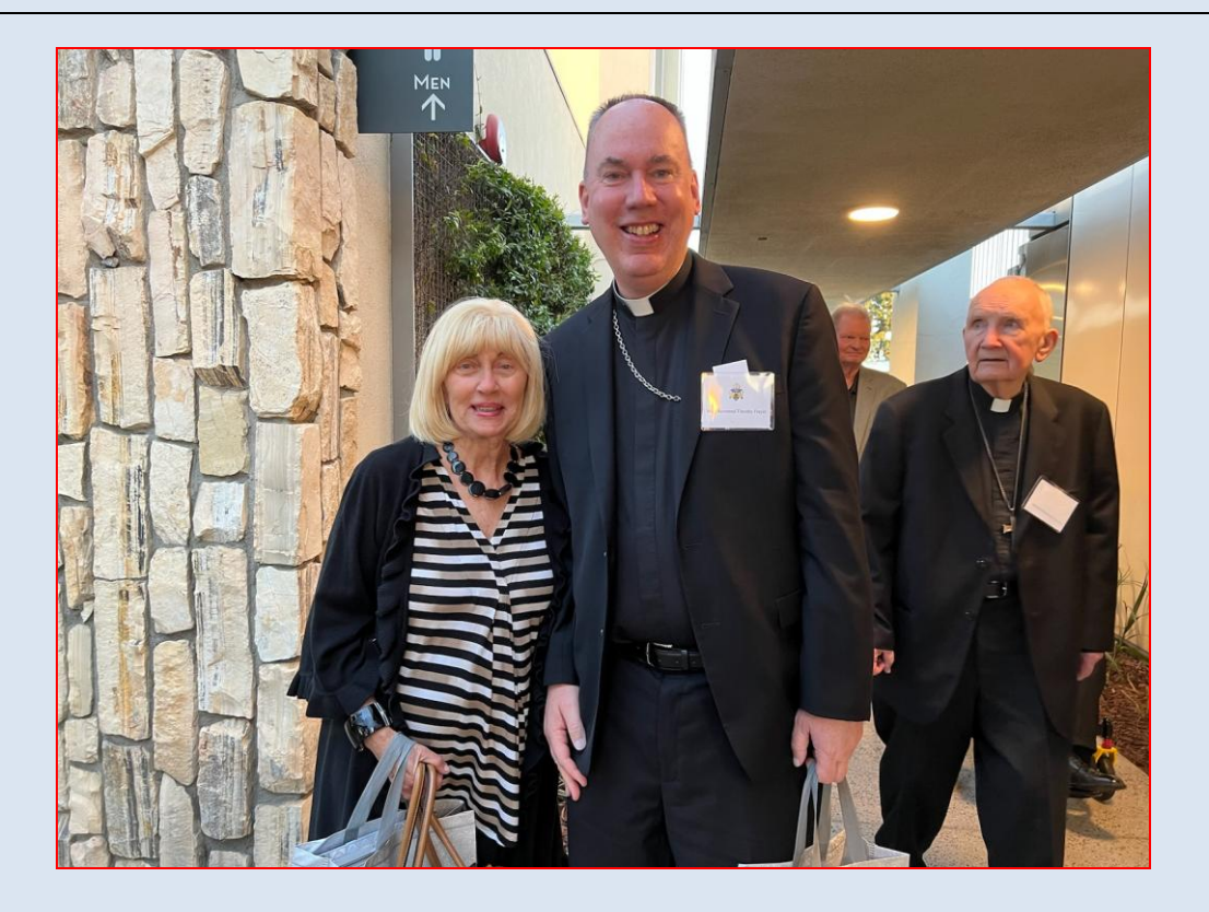
The Joy of Adopting a Seminarian