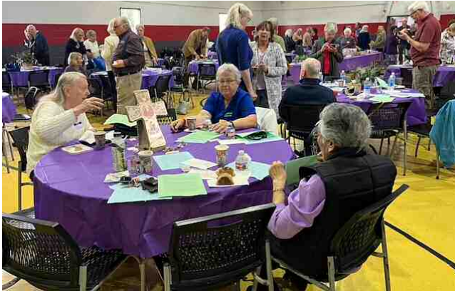
Its a Full House

Ninety-four (94) people attended the day of reflection including most our City Club and some visitors from the County Club.