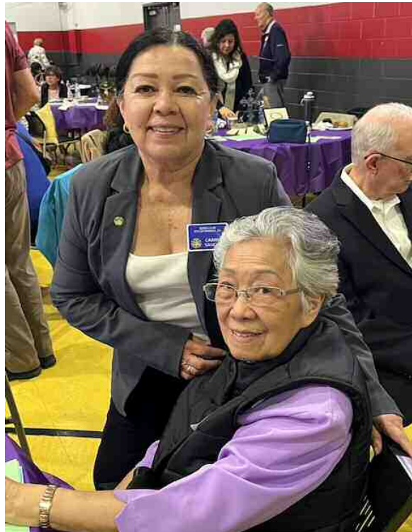
Full of Hope