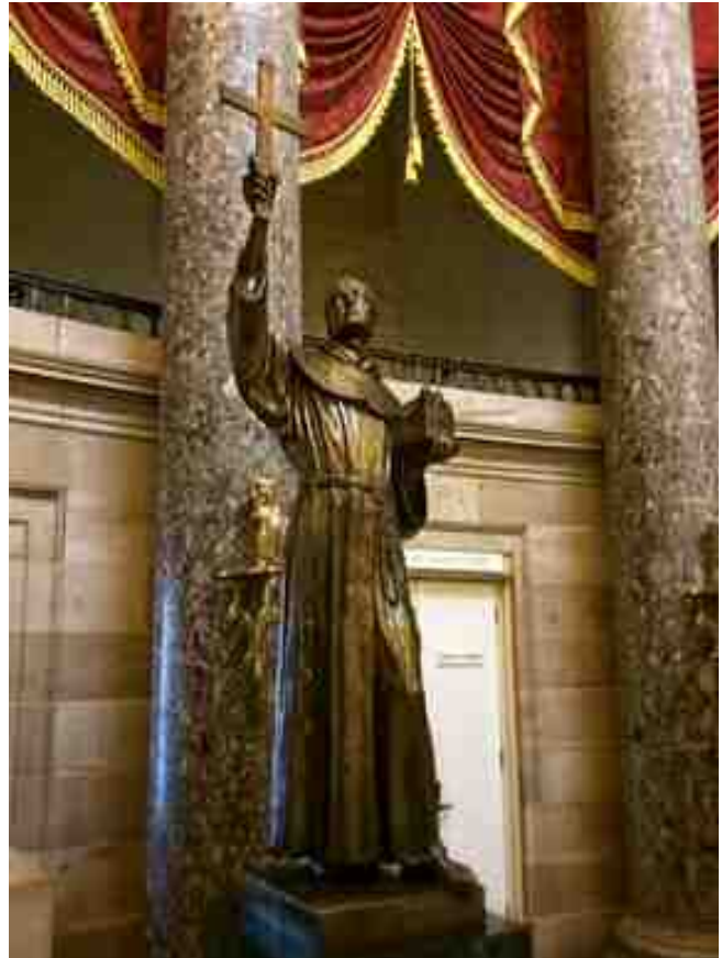
Fr. Junipero Serra