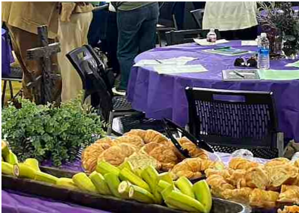
A Breakfast Spread for a Hundred

Ninety-four (94) people attended the day of reflection including most our City Club and some visitors from the County Club.