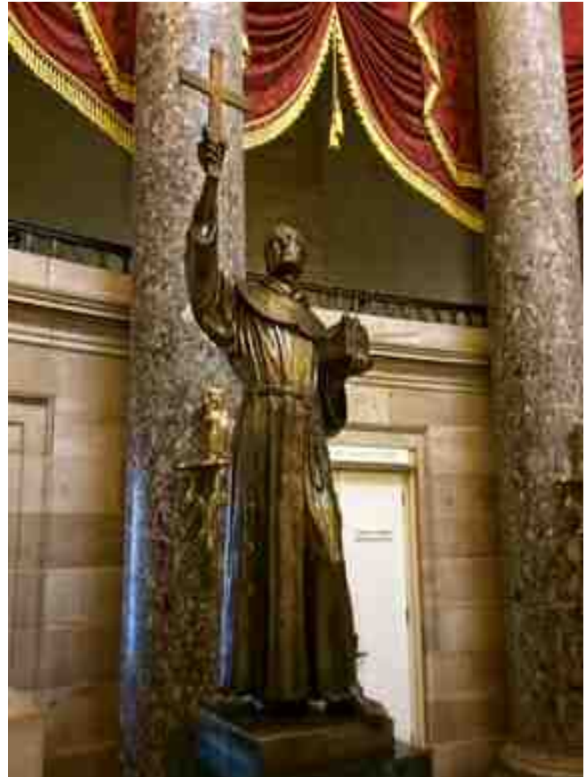
Fr. Junipero Serra