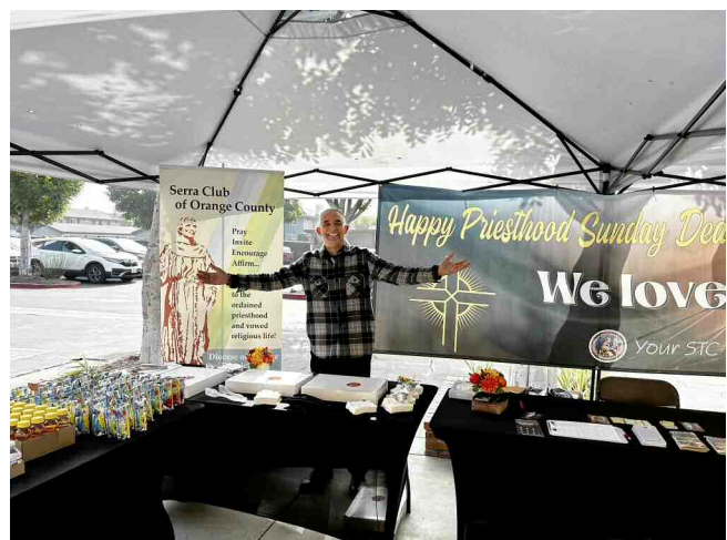
Recruiting for The 31 Club

Serrans covered Masses at St. Cecilia. and Holy Family to distribute spiritual bouquets for all the priests of the Parish on Priesthood Sunday.