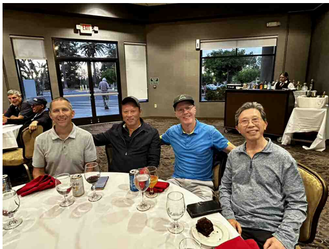
Happy at the 19th Hole

The golf tournament took place at Tustin Ranch Golf Course On September 16 th . All golfers, priests and deacons had a terrific time and a perfect weather on the course. Golfers and Serrans joined together afterwards for a lovely meal at Tustin Ranch Golf Club. The attendance was excellent as an extra table was