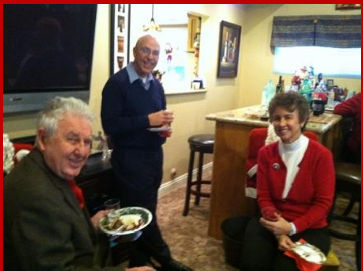
Memories of Serra Parties Past